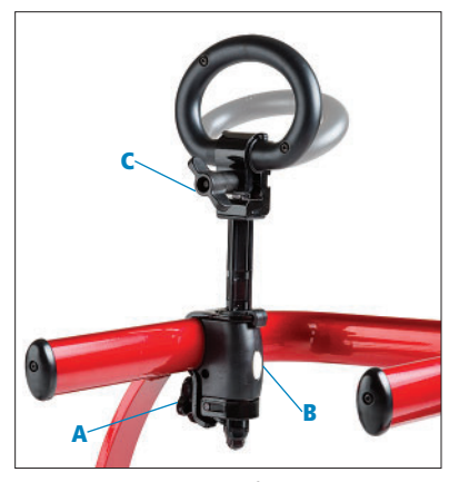
Figure 9a Mounted inside of top bar