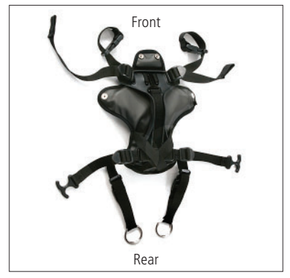
Figure 16b Underside of hip positioner with pad