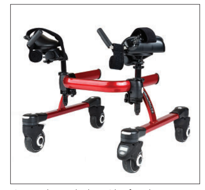
Figure 10b Attached outside of top bar