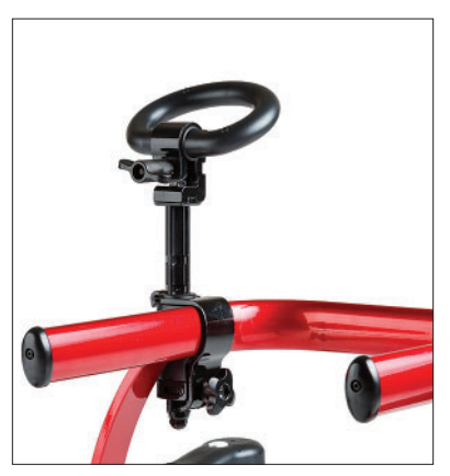
Figure 9b Mounted outside of top bar