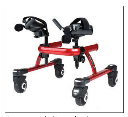
Figure 10c Attached inside of top bar